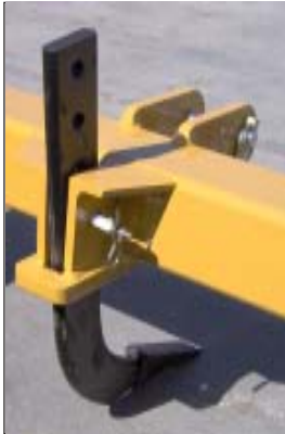
Special High Strength Shank Pockets