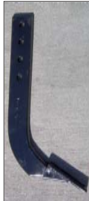
Adjustable Shanks with Four Settings