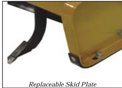
Replaceable Skid Plate