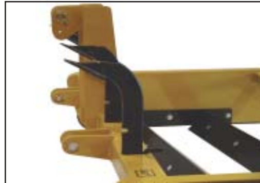
Ripping Shanks In Storage Position