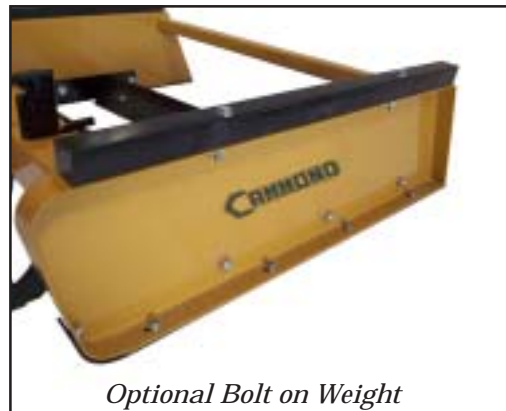
Optional Bolt on Weight