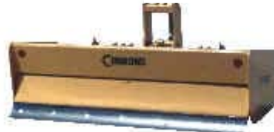
4C2 Floating Tailboard